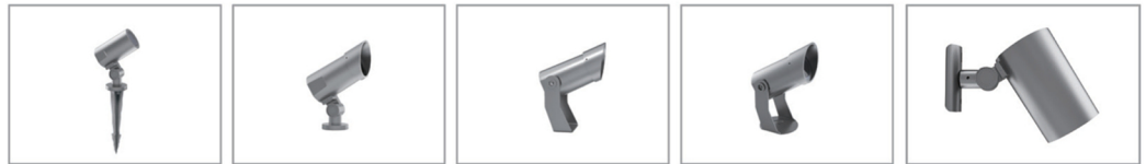
Spike for ground