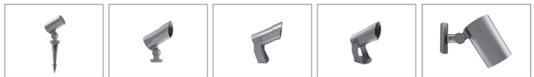
Spike for ground