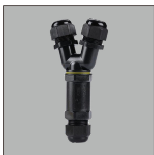
M685-Y IP68 Waterproof connector 140mm*72mm

Pluxb luminaires are developed with globally recognized and tested components suppliers, however as per international standards tolerance in initial flux and connected load is at \pm 5\% . Unless stated otherwise, the values apply to an ambient temperature of 25°C