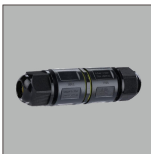
M684-B(5P) IP68 Waterproof connector 99mm*25mm