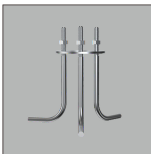
J Anchor Bolt Kit Φ120*200mm