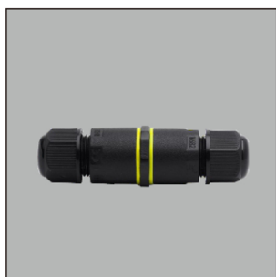
M682-B(3P) IP68 Waterproof connector 72mm*21mm